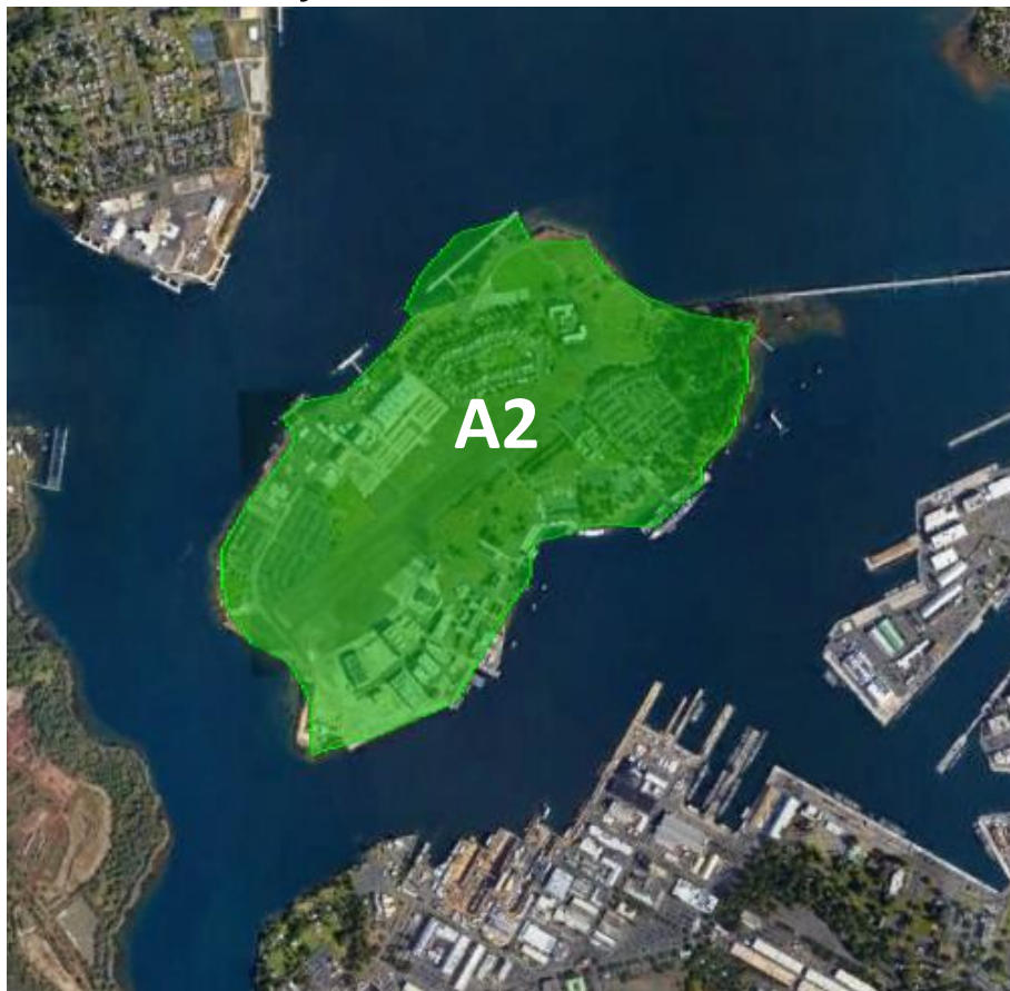
Neighborhoods included in Zone A2: Ford Island

Joint Base Pearl Harbor-Hickam (JBPHH) 26 February 2022