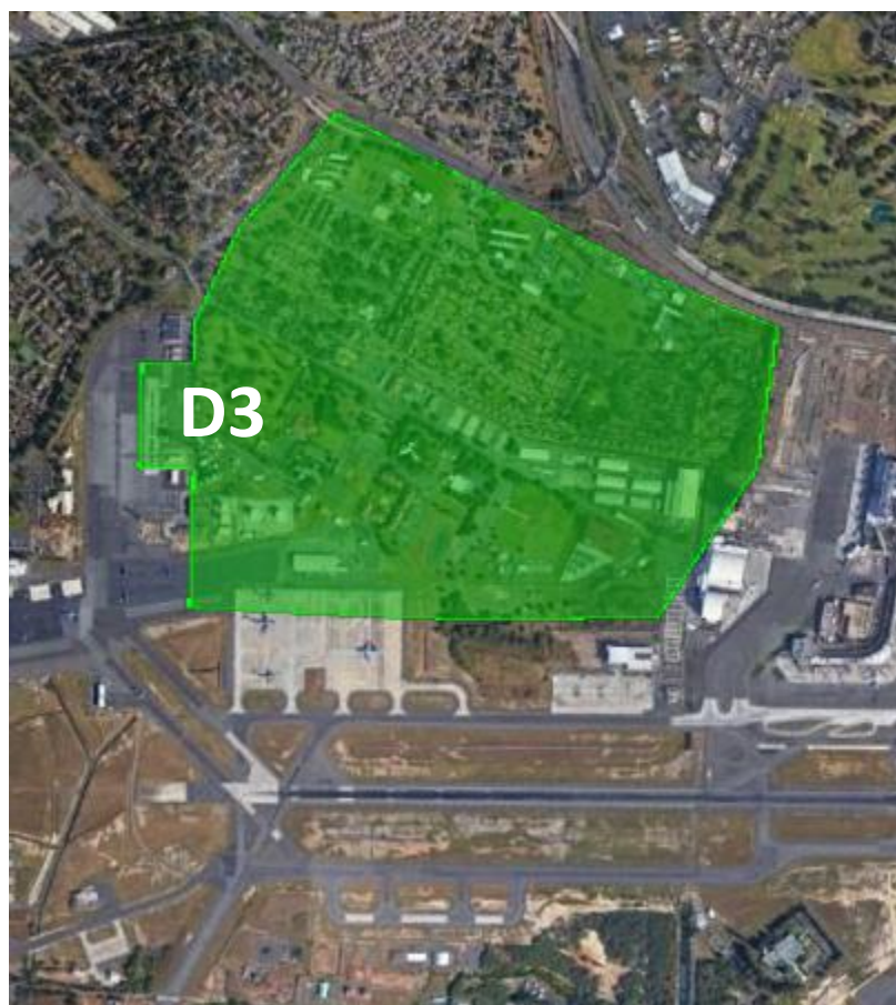
Neighborhoods included in Zone D3: Earhart Village