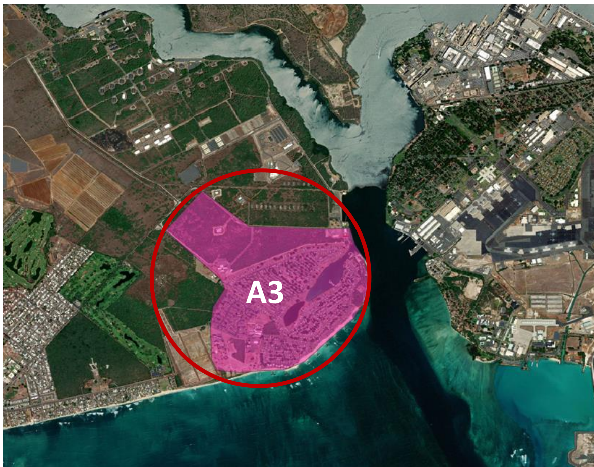
Neighborhoods included in Zone A3: Iroquois Point