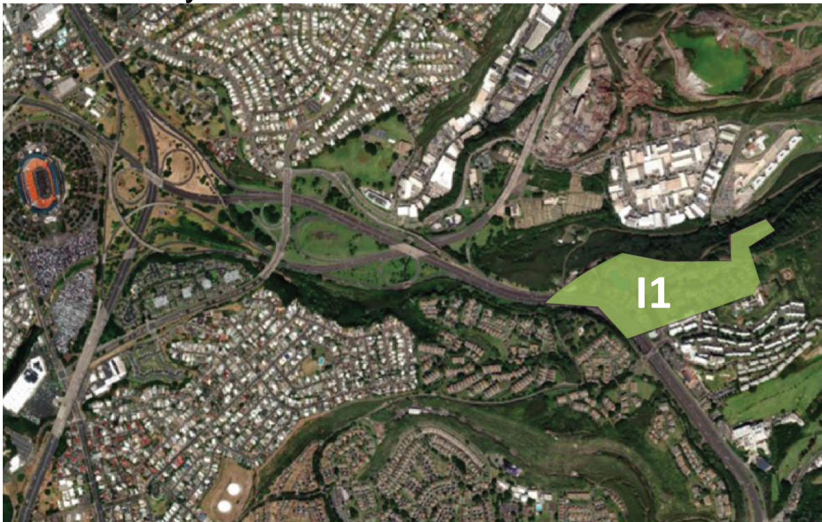
Neighborhoods included in Zone I1: Red Hill Housing