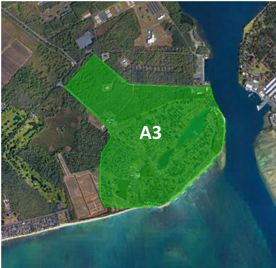
Neighborhoods included in Zone A3: Iroquois Point