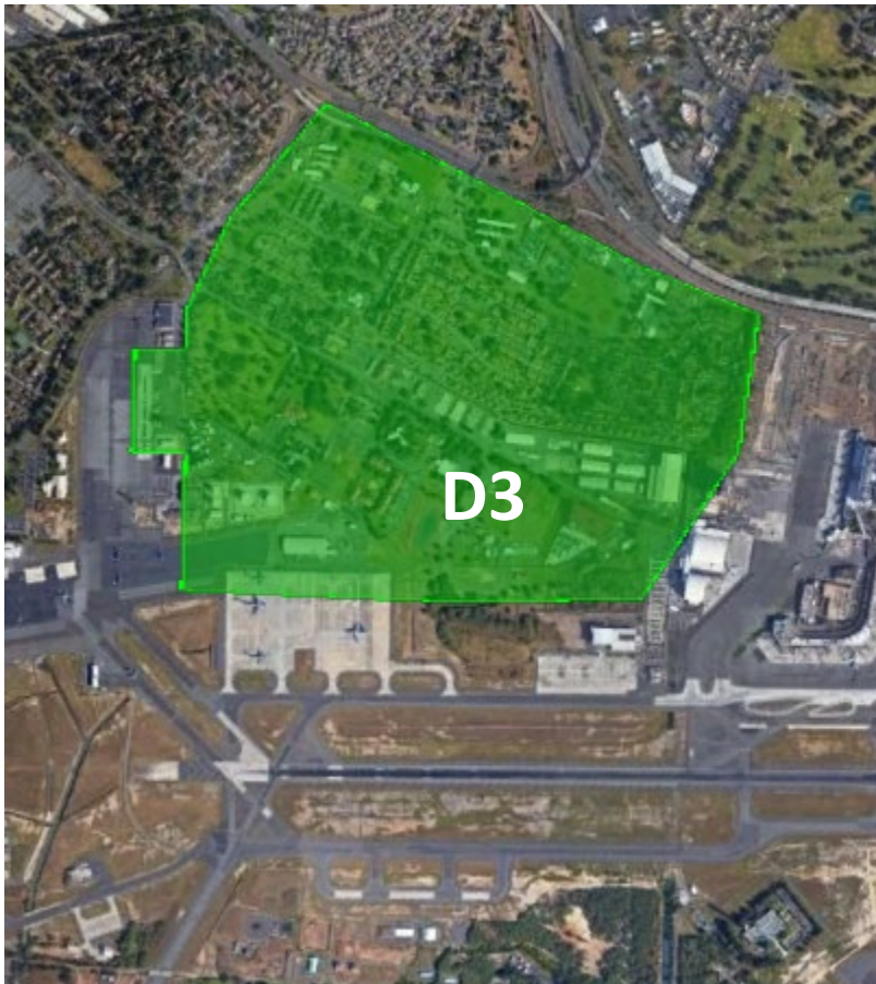
Neighborhoods included in Zone D3: Earhart Village