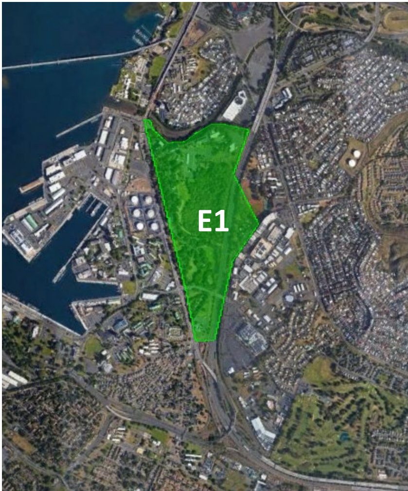
Neighborhoods included in Zone E1: Makalapa

Drinking Water Distribution System Recovery Plan: Stage 5 Long-Term Monitoring (LTM) Month 1 Sampling Results Report for Zone E1 26 May 2022