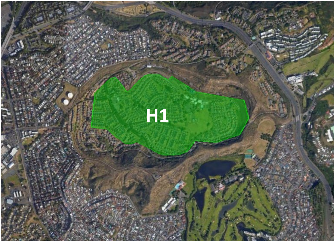
Neighborhoods included in Zone H1: Aliamanu Military Reservation (AMR)