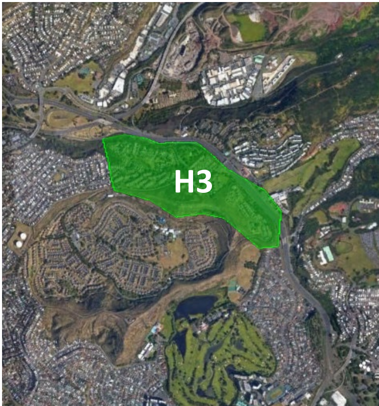
Neighborhoods included in Zone H3: Aliamanu Military Reservation (AMR)