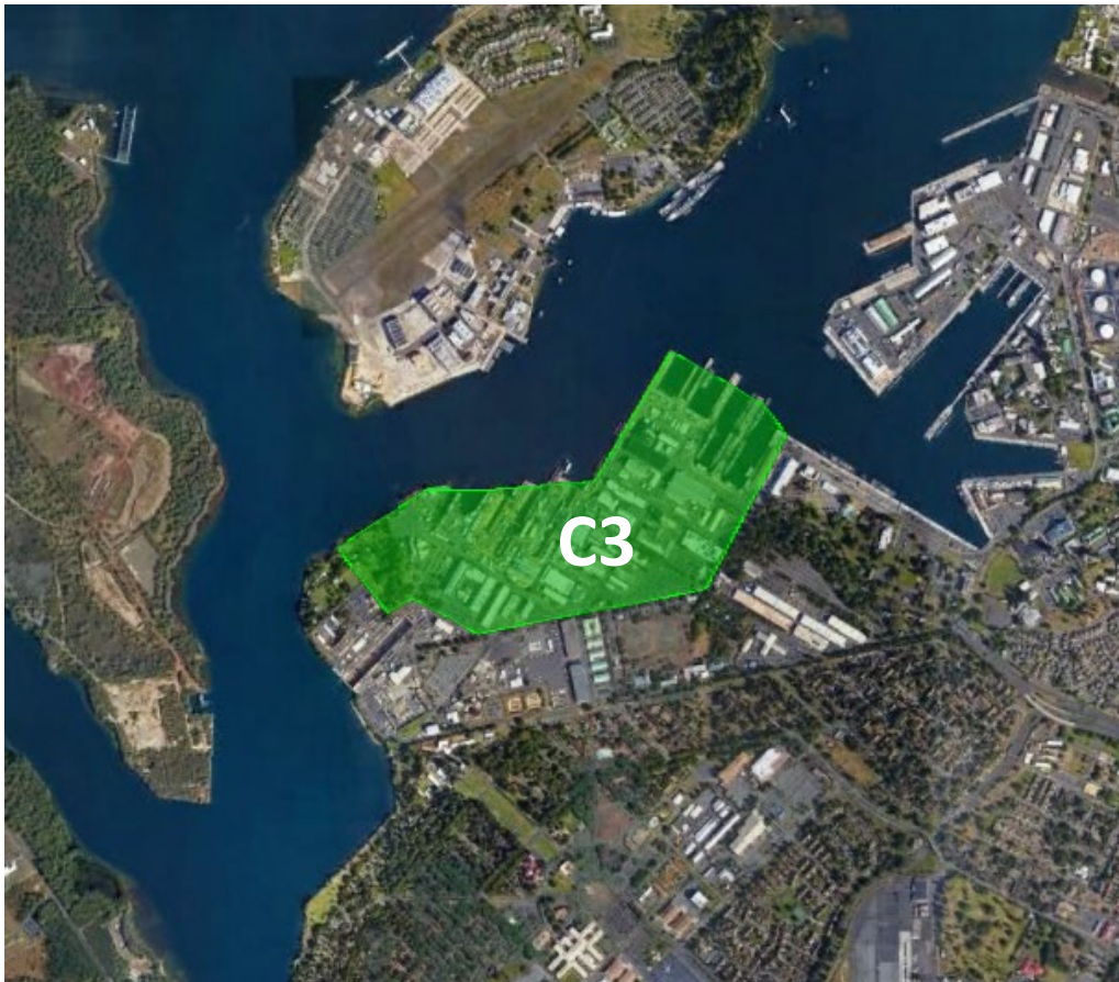
Neighborhoods included in Zone C3: Shipyard, Hospital Point