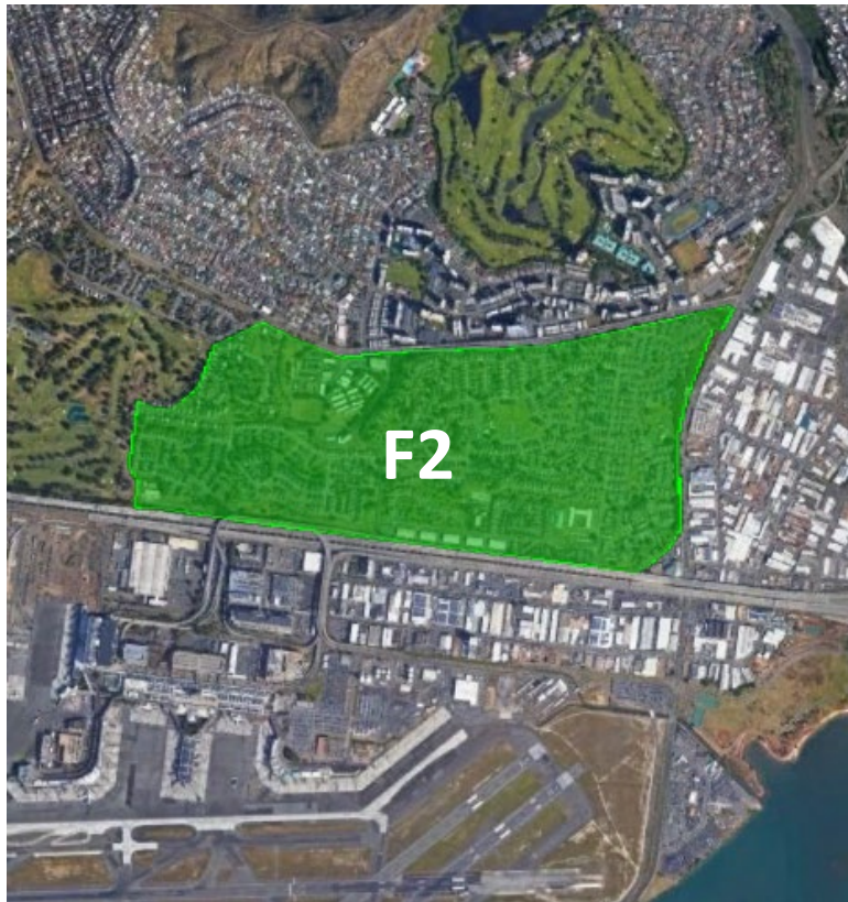
Neighborhoods included in Zone F2: Catlin Park, Maloelap, Doris Miller, Halsey Terrace, Radford Terrace