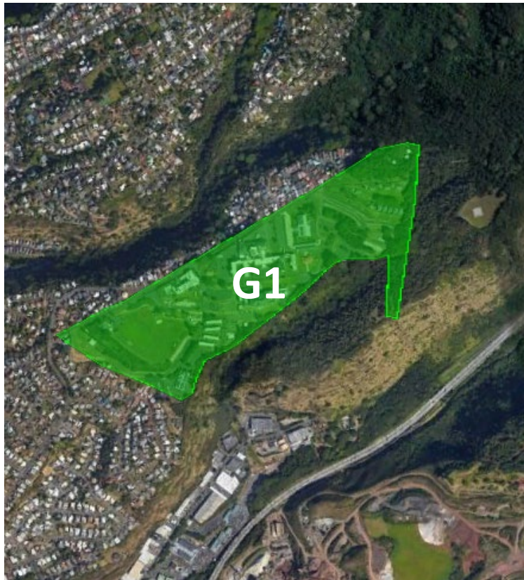
Neighborhoods included in Zone G1: Camp Smith