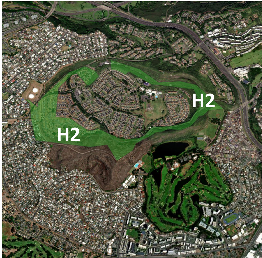
Neighborhoods included in Zone H2: Aliamanu Military Reservation (AMR)