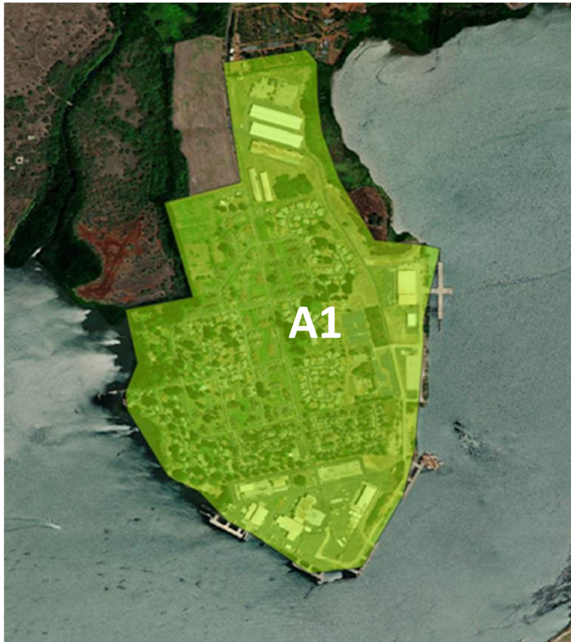
Neighborhoods included in Zone A1: Pearl City