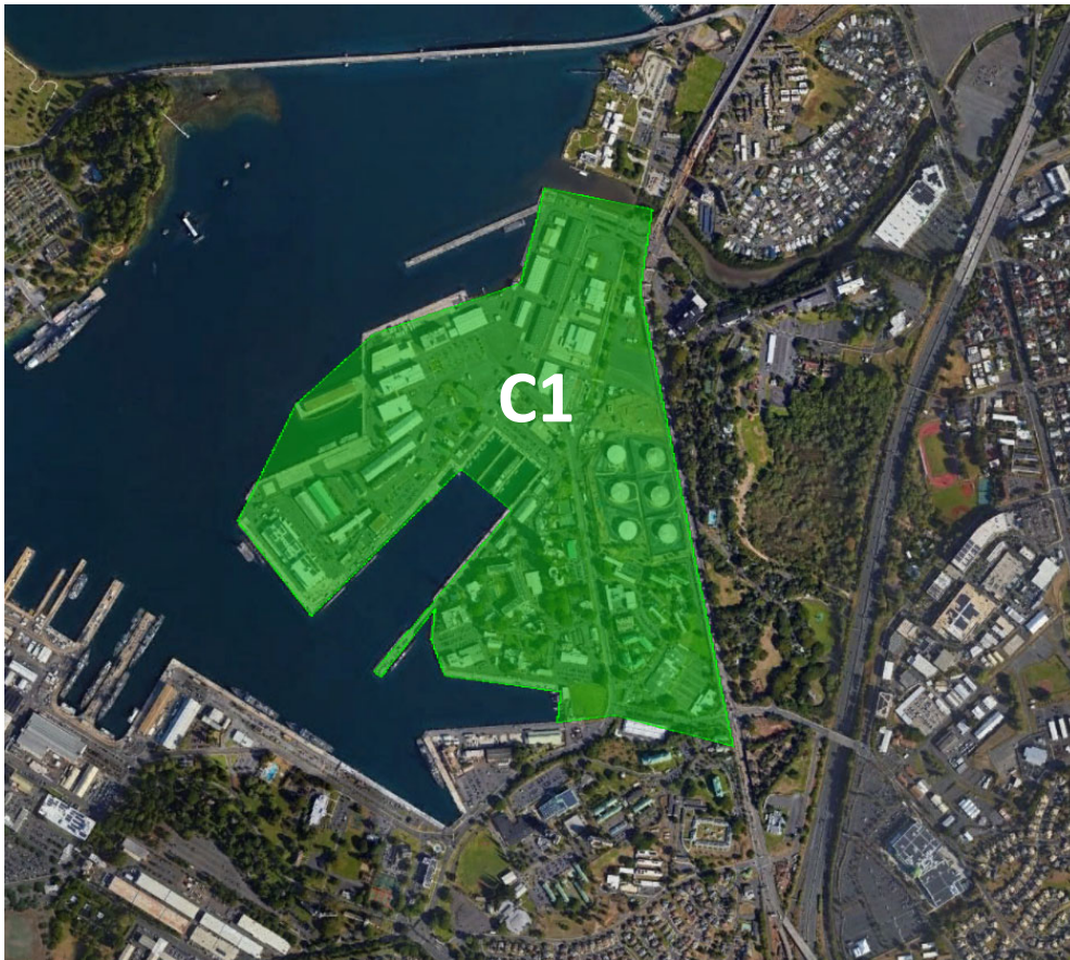
Neighborhoods included in Zone C1: Sub Base