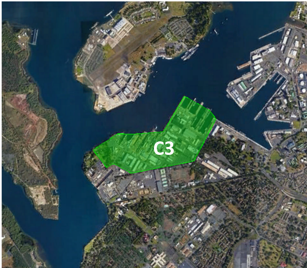
Neighborhoods included in Zone C3: Shipyard, Hospital Point