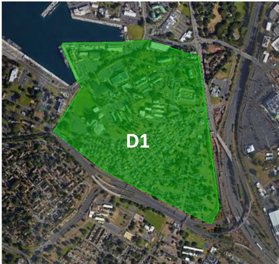
Neighborhoods included in Zone D1: Hale Moku and Hokulani