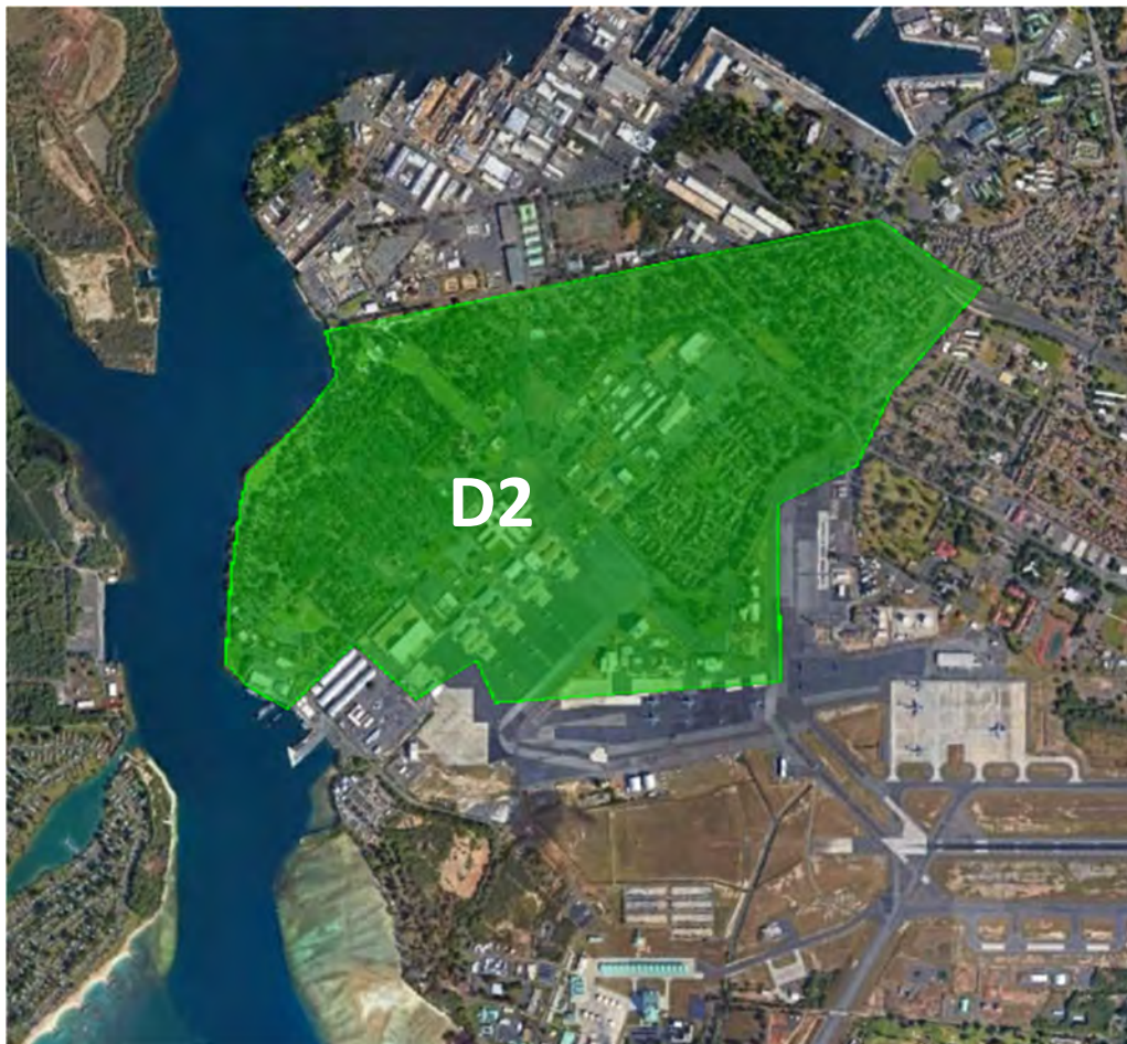
Neighborhoods included in Zone D2: Hickam, Hale Na Koa, Officer Field Area, Onizuka Village