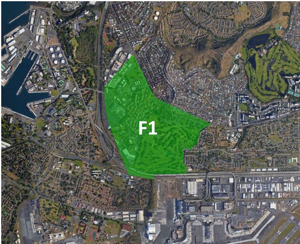
Neighborhoods included in Zone F1: NEX, Moanalua Terrace