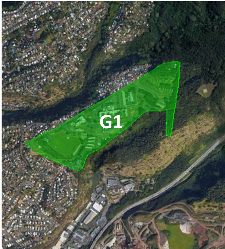
Neighborhoods included in Zone G1: Camp Smith