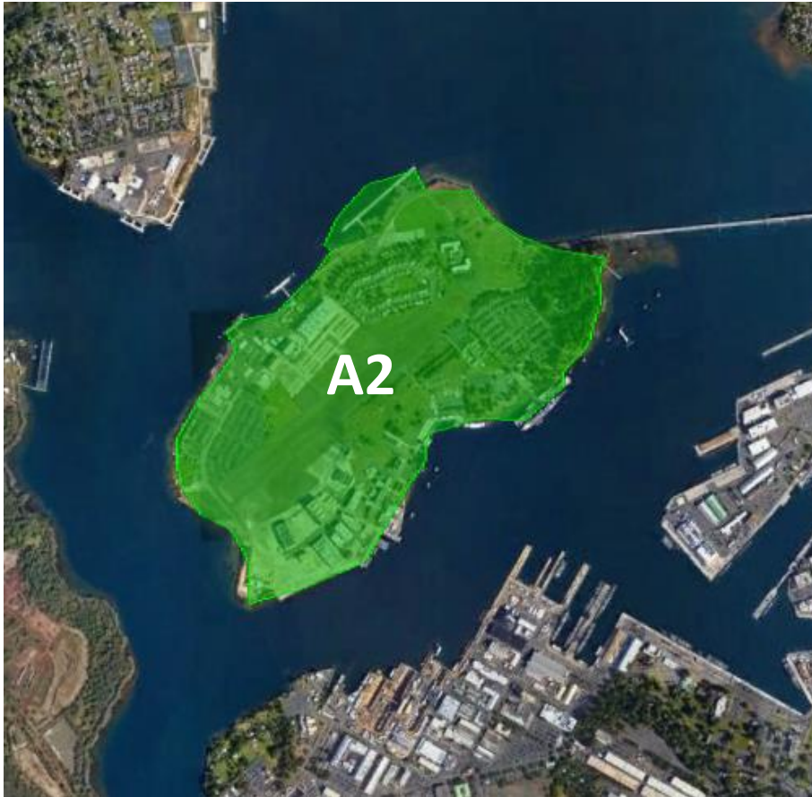
Neighborhoods included in Zone A2: Ford Island