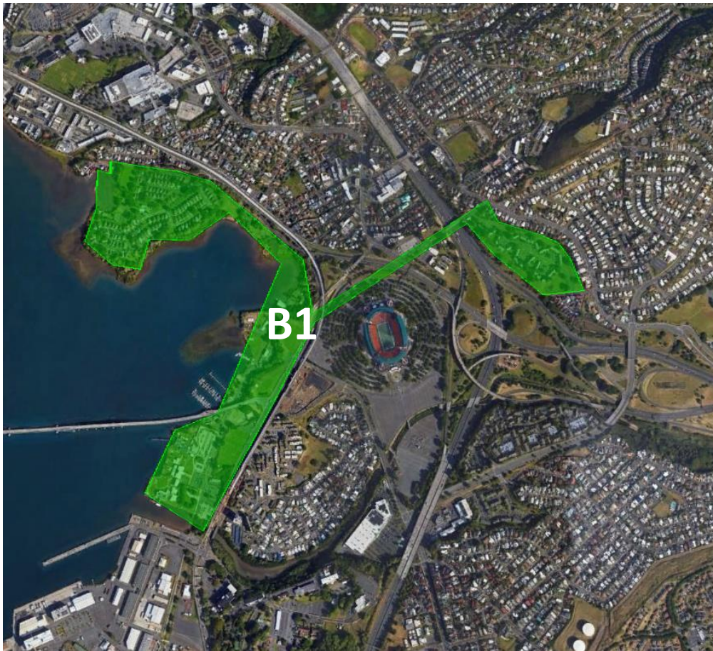
Neighborhoods included in Zone B1: McGrew and Halawa