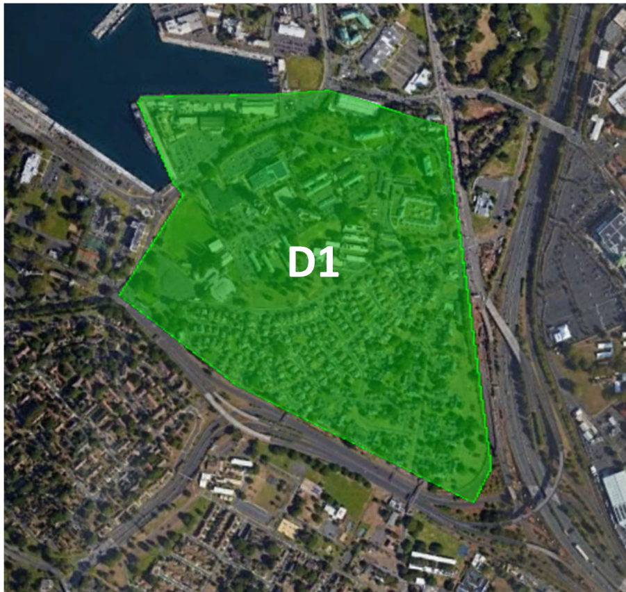
Neighborhoods included in Zone D1: Hale Moku and Hokulani