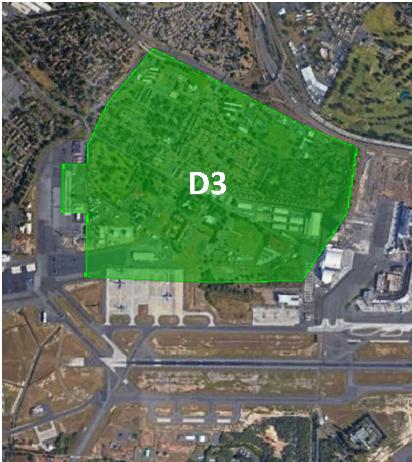
Neighborhoods included in Zone D3: Earhart Village