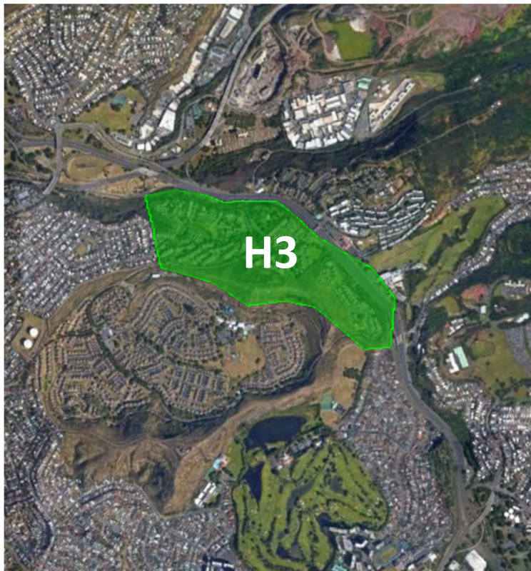
Neighborhoods included in Zone H3: Red Hill Housing

Drinking Water Distribution System Recovery Plan: Stage 5 Long-Term Monitoring (LTM) Period 4 Sampling Results Report for Zone H3 8 December 2022