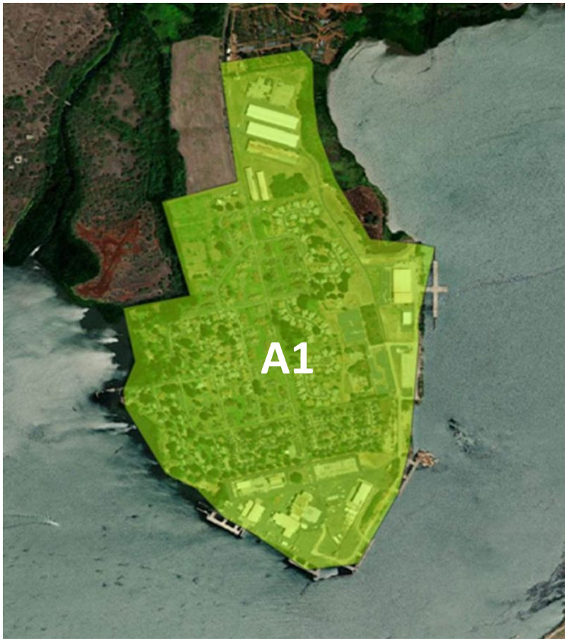
Neighborhoods included in Zone A1: Pearl City