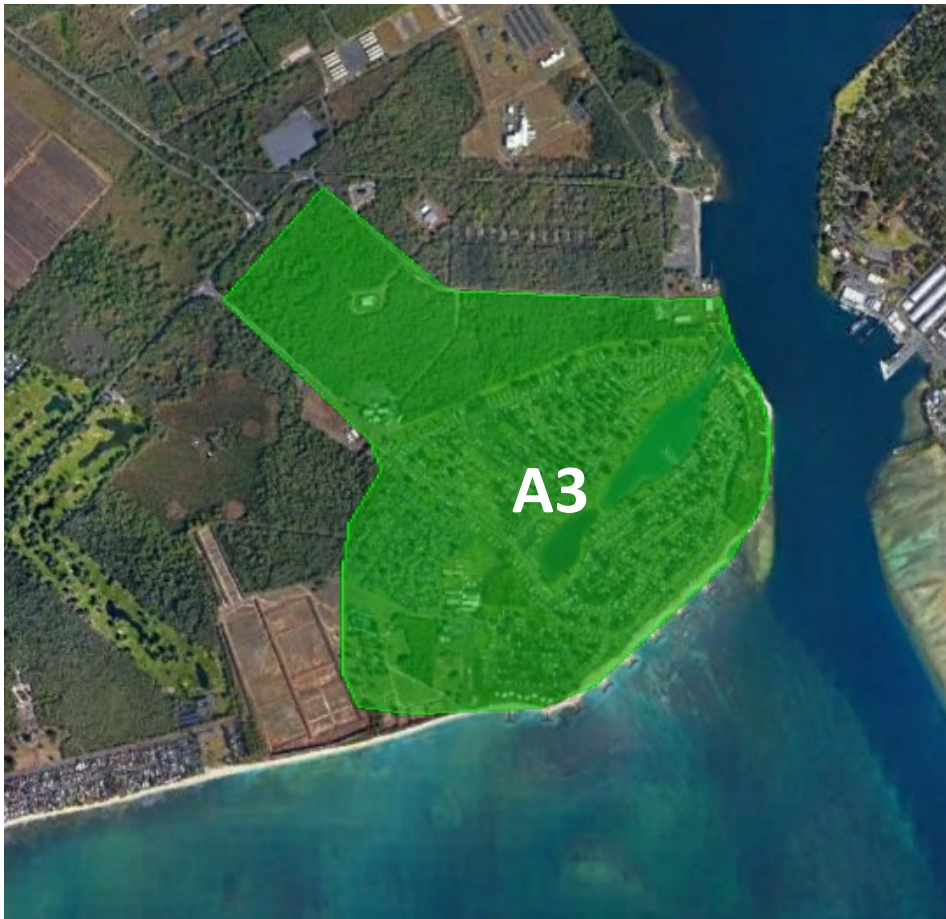
Neighborhoods included in Zone A3: Iroquois Point