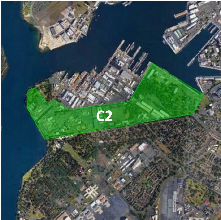
Neighborhoods included in Zone C2: Hale Alii, Marine Barracks, Hospital Point