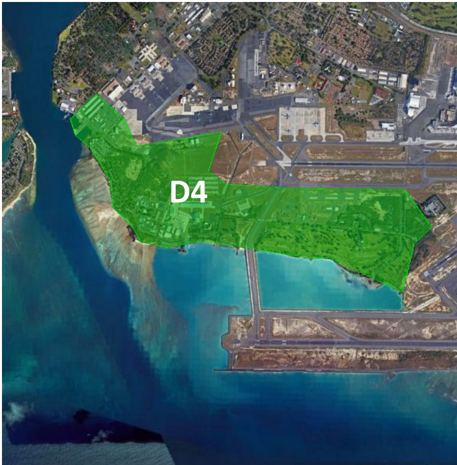
Neighborhoods included in Zone D4: Hawaii Air National Guard