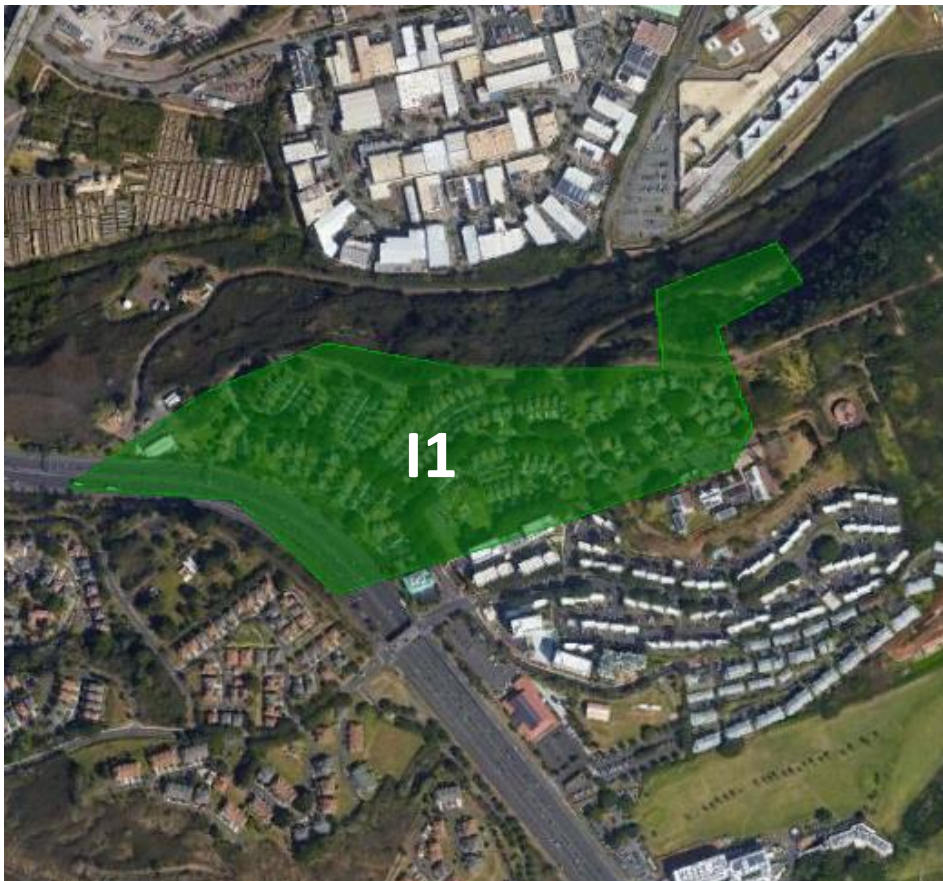
Neighborhoods included in Zone I1: Red Hill Housing

Drinking Water Distribution System Recovery Plan: Stage 5 Long-Term Monitoring (LTM) Period 5 Sampling Results Report for Zone I1 1 June 2023