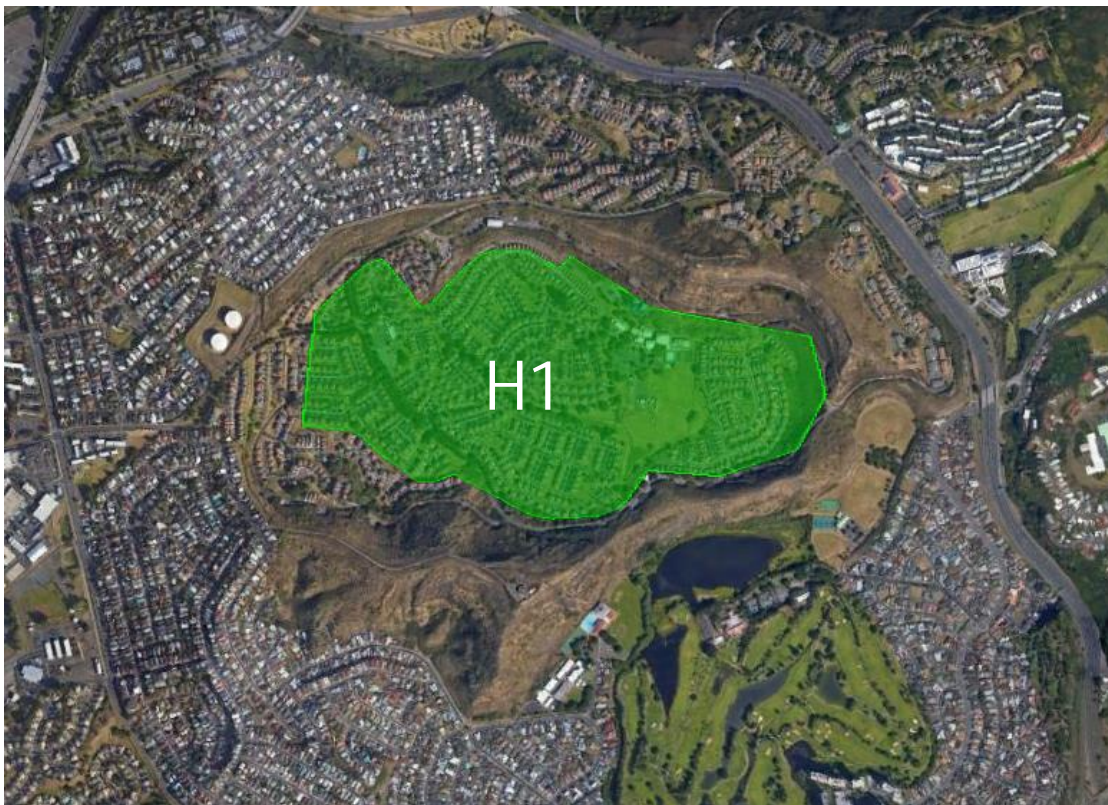
Neighborhoods included in Zone H1: Aliamanu Military Reservation (AMR)